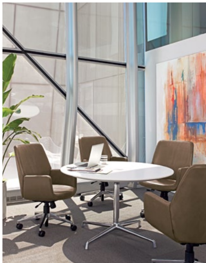
Bindu mid back executive seating shown with SW_1 table

———— Bindu offers a clear alternative in look and feel with its synchro-tilt mechanism and flex back, which enables users to fluidly change postures whether collaborating or computing.