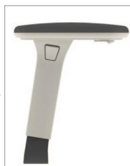
stone multi-adjustable arm with black arm support