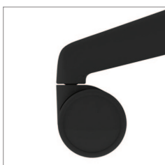
black nylon base with 65mm castor