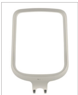
stone outer frame