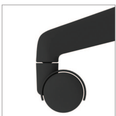
black nylon base with 50mm castor