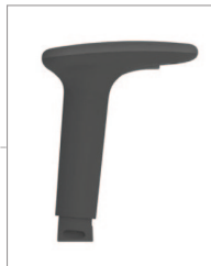
black height adjustable arm