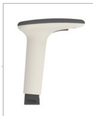
stone height adjustable arm