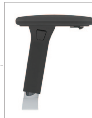
black multi-adjustable arm with polished arm support