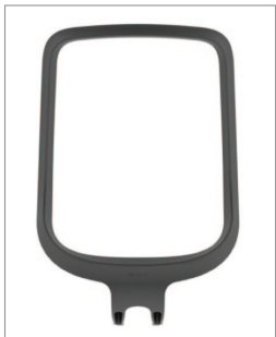
black outer frame