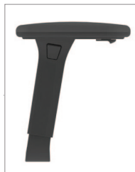
black multi-adjustable arm with black arm support