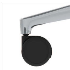
polished aluminium base with 65mm castor