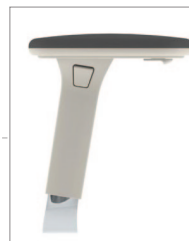
stone multi-adjustable arm with polished arm support