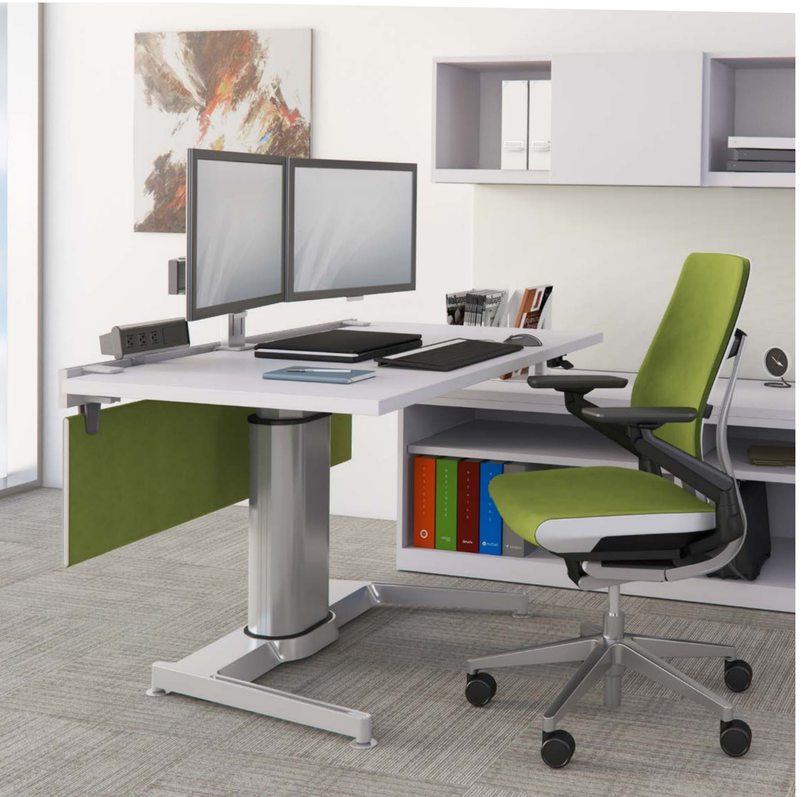
Airtouch collaborative height-adjustable tables