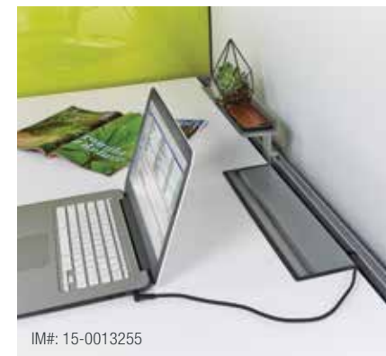
Integrated rail with SOTO shelf and access to power

Different workstyles require different ergonomic support—and Ology provides just that. The integrated rail supports adjustable monitor arms, lighting and worktools, while power and data remain within reach.