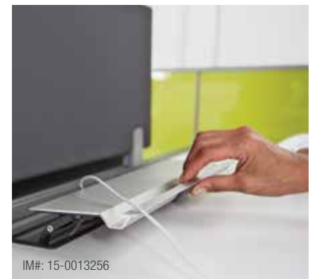
Integrated rail with screen and access to power