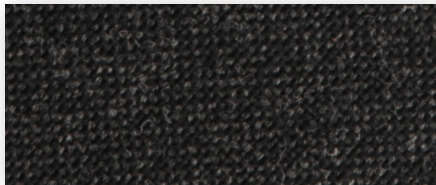
Hallingdal 65, 70% Wool, 30% viscose Colour: 180 / Black grey