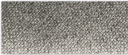
Hallingdal 65 70% Wool, 30% viscose Colour: 130 / Grey