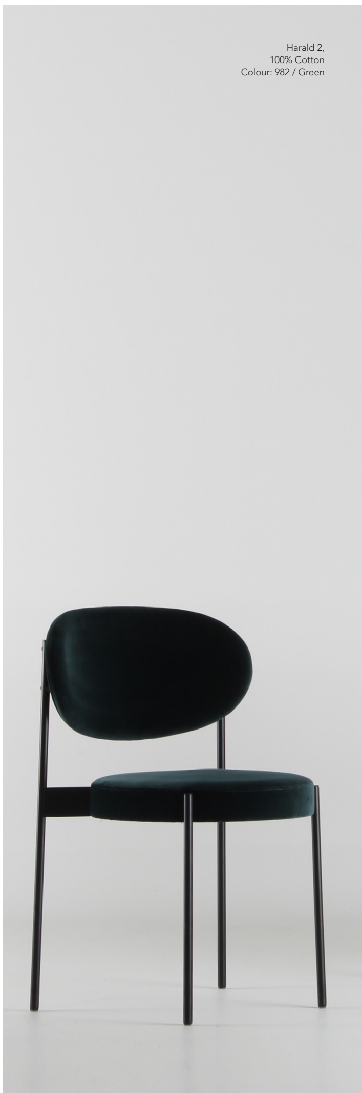
Harald 2, 100% Cotton Colour: 982 / Green