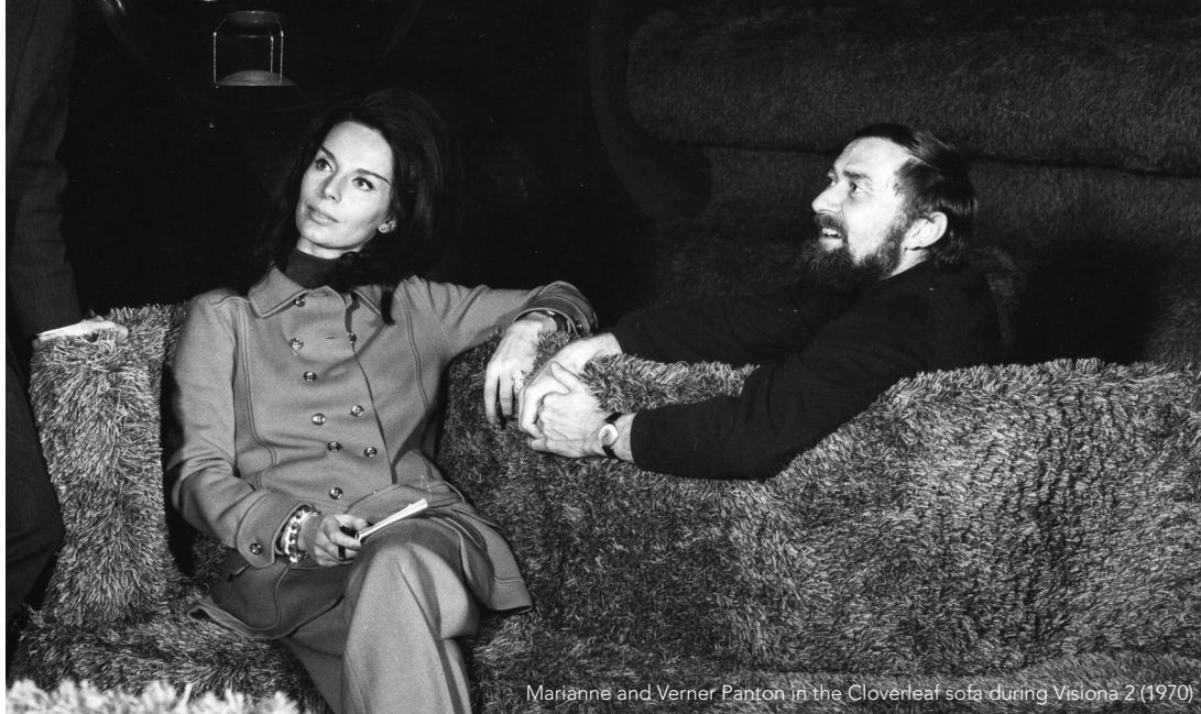
Marianne and Verner Panton in the Cloverleaf sofa during Visiona 2 (1970)

All of the Verpan products stand out as some of the most elegant and memorable of Verner Panton's designs. Products that create life, sound, movement, color and light - design that brings value into the visual world around us all.