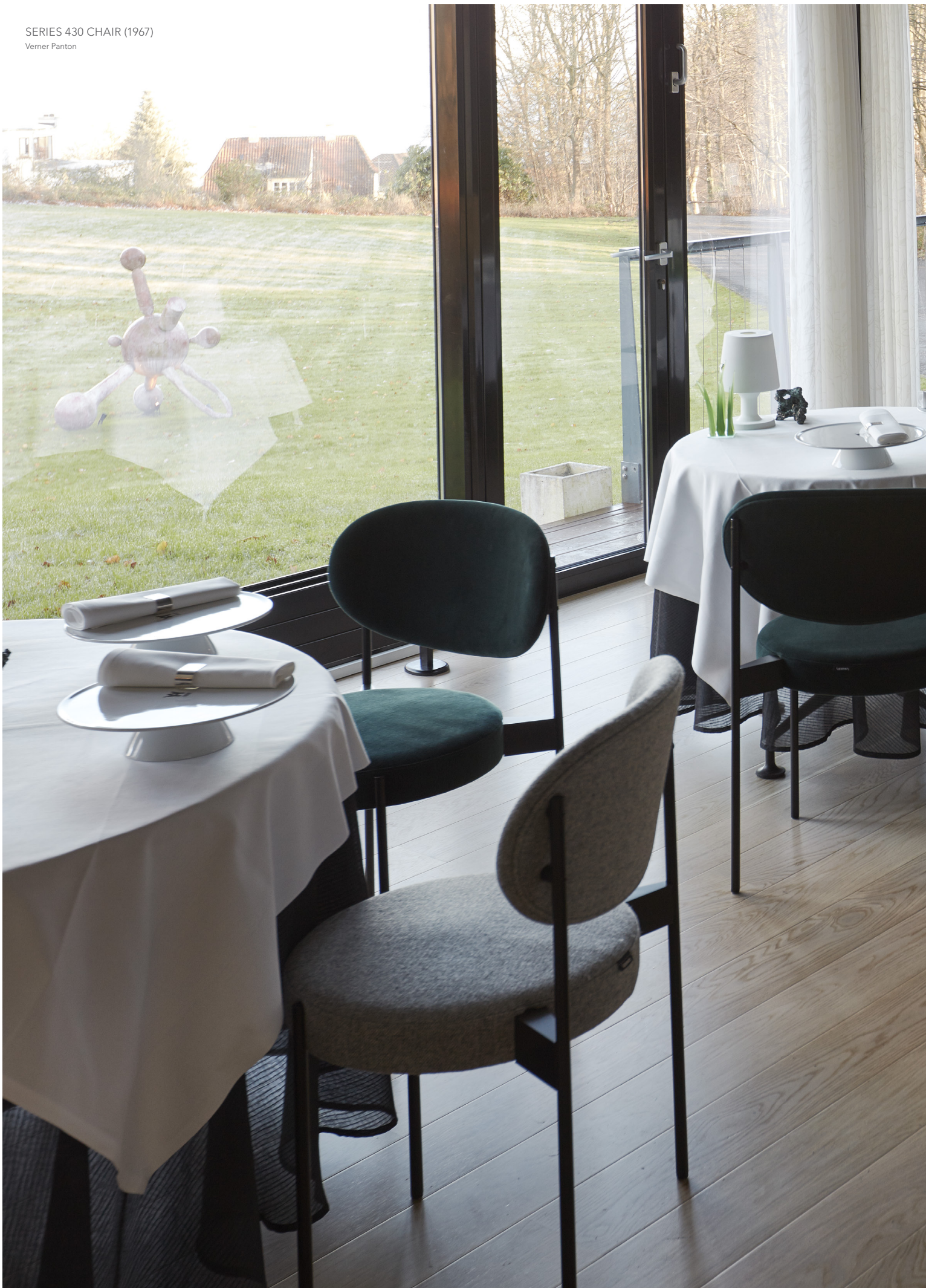
SERIES 430 CHAIR (1967) Verner Panton