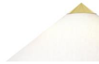
// Canvas shade