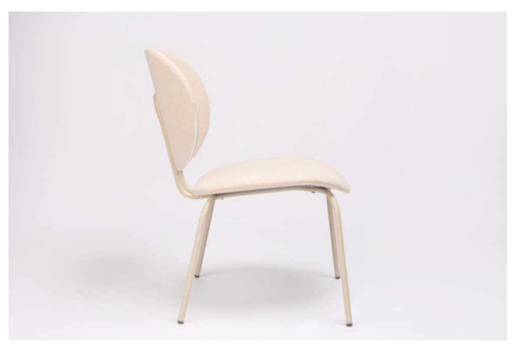
SHARXLETK HARI XL CHAIR