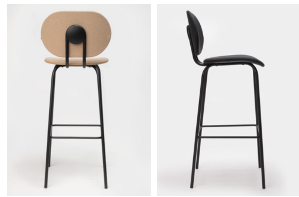
THAR2ETB HARI STOOL H75