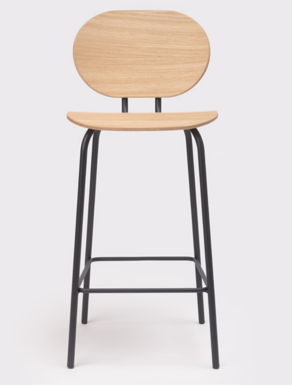
THAR1ERBRB HARI STOOL H65 STAINED OAK