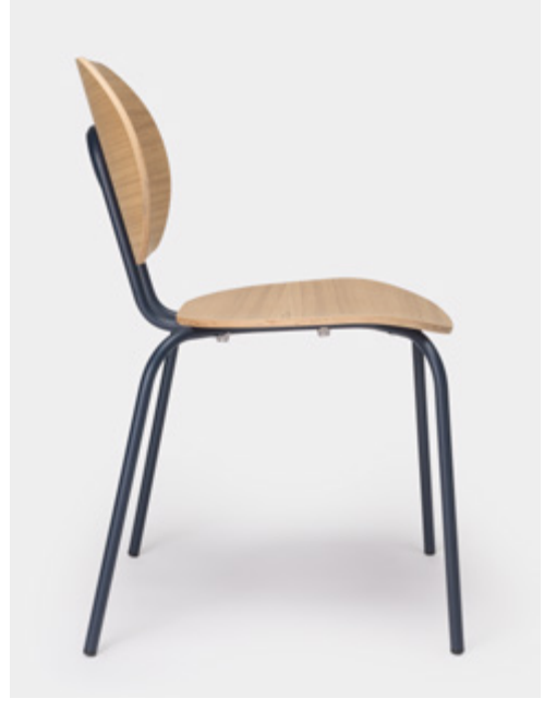
{\tt SHARERBRB} \ \ \underline{{\tt HARI}} \ \ \underline{{\tt CHAIR}} \ \ \underline{{\tt STAINED}} \ \ \underline{{\tt OAK}}