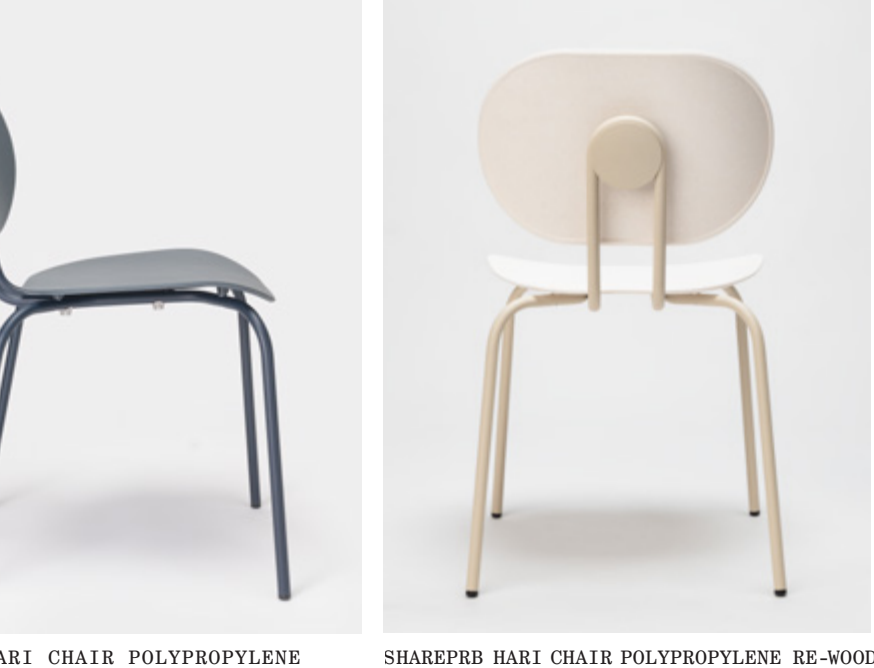
SHAREPVE HARI CHAIR POLYPROPYLENE SHAREPA HARI CHAIR POLYPROPYLENE