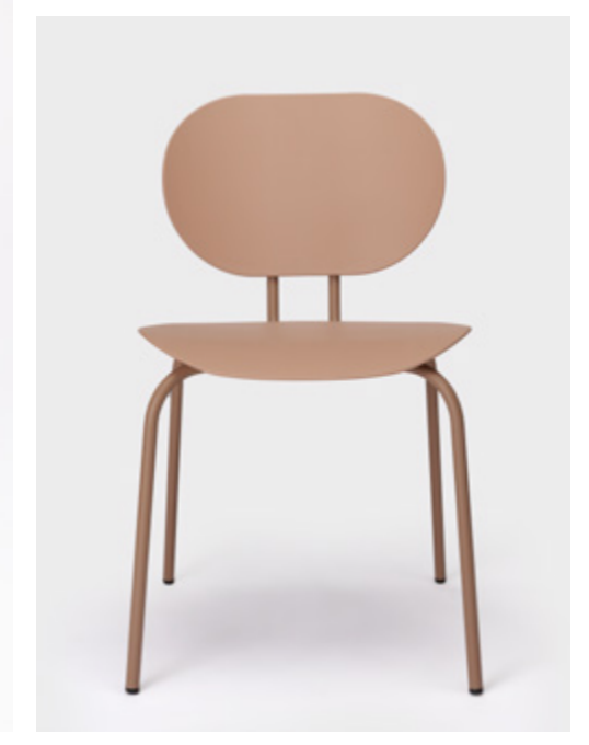
SHAREPAR HARI CHAIR POLYPROPYLENE