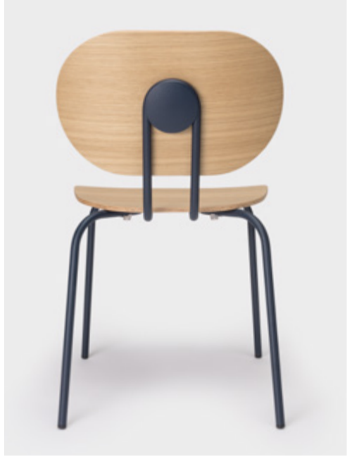
SHARERBRB HARI CHAIR STAINED OAK