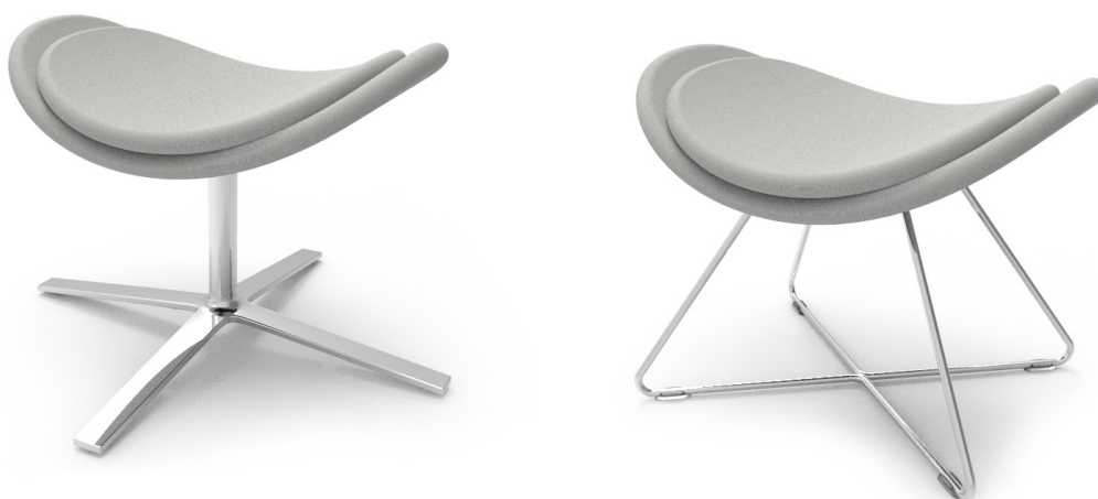
Top – AVI-01 & AVI-03, Bottom – AVI-05 & AVI-06 Footstools