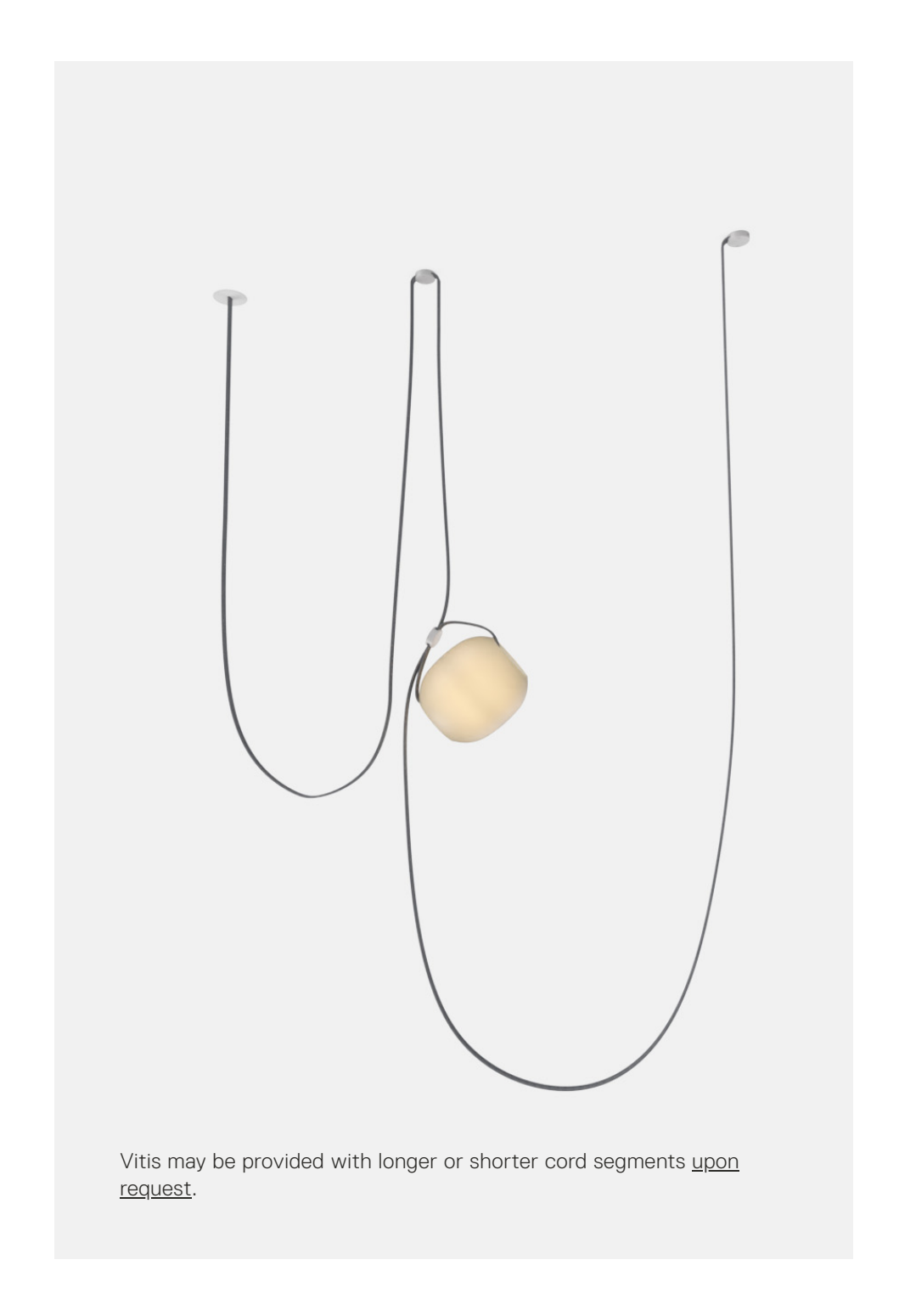
For 2D & 3D drawings of all products, including CAD, Revit and IES files, please visit rbw.com

50 Greene St New York NY 10013 T +1 212 388 1621 sales@rbw.com