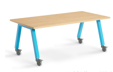
Model # Shown: 25212