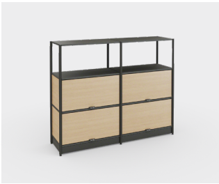
End of Run