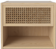
Cana Bedside Table H36 cm