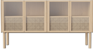
Cana Sideboard 159 cm

The parcel's measurements The parcel's measurements 1: 0.53 m3, 64.0 kg (D 43.0 cm, W 83.6 cm, H 146.2 cm)) The parcel's measurements 2: 0.08 m3, 5.5 kg (D 34.0 cm, W 76.0 cm, H 30.0 cm))