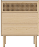
Cana Dresser, H91,5 cm

The parcel's measurements The parcel's measurements 1: 0.43 m3, 52.0 kg (D 36.0 cm, W 82.0 cm, H 145.0 cm))