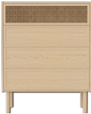
Cana Dresser, H113 cm

The parcel's measurements The parcel's measurements 1: 0.40 m3, 62.5 kg (D 43.0 cm, W 161.0 cm, H 57.7 cm)) The parcel's measurements 2: 0.18 m3, 5.5 kg (D 36.0 cm, W 153.0 cm, H 31.9 cm))