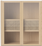
Cana Wall Cabinet