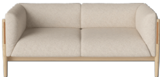
Dive Sofa 2 seater