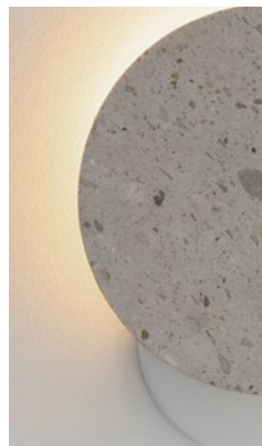
Ambra wall round grey white PV002-bl