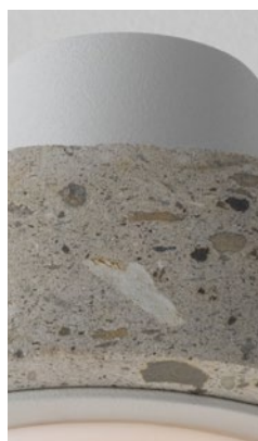
Ambra wall grey white PV002-bl